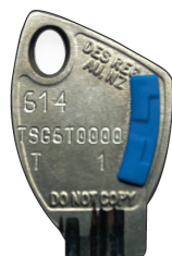
GEN6 / GEN6T