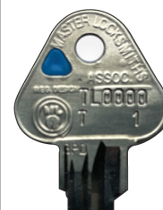
BP / LS SERIES